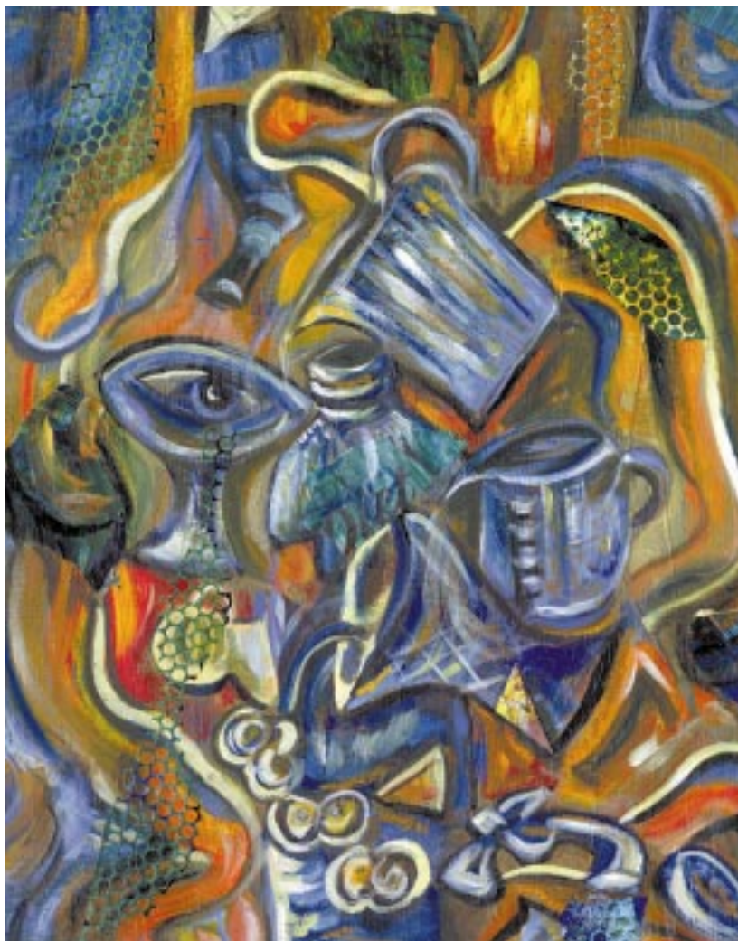
Diabetes Insipidus (donated to the Pituitary Foundation office)

The Samuel Leonard Simpson Fellowships in Endocrinology enable endocrinologists to travel either to or from the UK. Up to £20 000 is available. The closing date for applications is 1 July 2000 . Email: conferences@rcplondon.ac.uk ; Fax: 020-74875218.