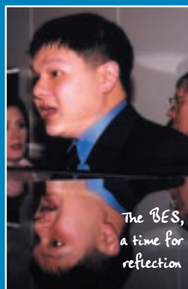
The BES, a time for reflection