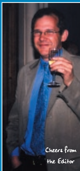
Cheers from the Editor