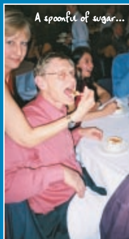
A spoonful of sugar...