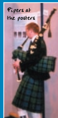
Pipers at the posters