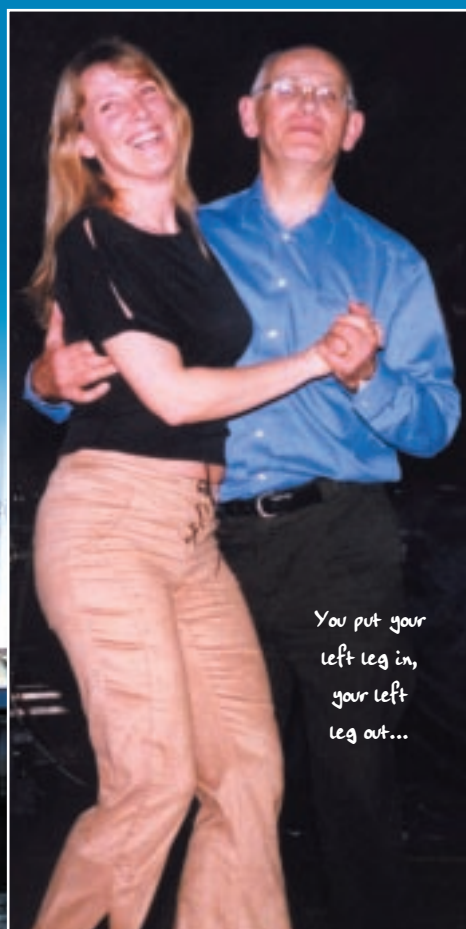
You put your left leg in, your left leg out...