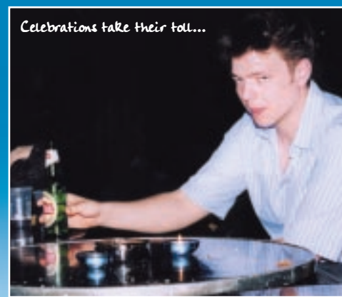
Celebrations take their toll...