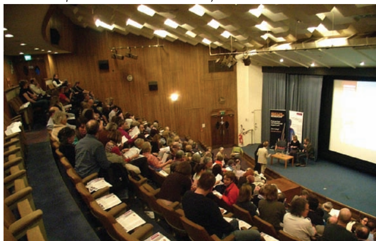
BELOW: The packed auditorium saw a lively debate.